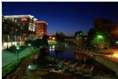
Downtown Greenville, South Carolina